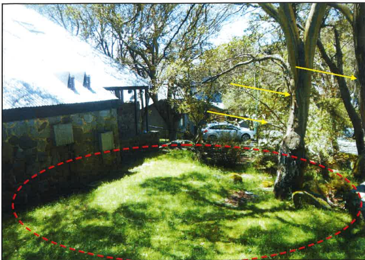
Figure 3: Proposed works location and trees to be removed