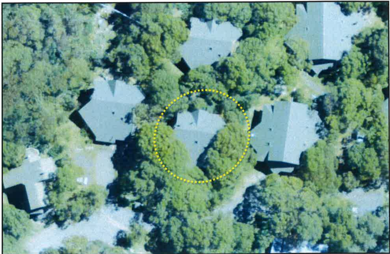
Figure 1: Subject site (yellow circle)

Established eucalypt woodland vegetation is located within the site, three of which will be removed for the proposal.